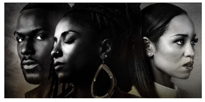
QUEEN SUGAR OWN Season 2 Premiere June 20 & 21

Inspired by the book Satan's Sisters written by Star Jones, one of the original co-hosts of The View , the series will chronicle the daily fireworks that erupt between the five female co-hosts of a fictitious long-running talk show, "The Lunch Hour." On screen, they are best friends with five very different points of view, but behind the scenes they inhabit a world of power struggles, cat-fights and cocktails. Cast includes Vanessa L. Williams and Tichina Arnold.